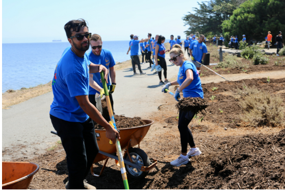
Photo: Volunteers at the Candlestick Point Stewardship Project