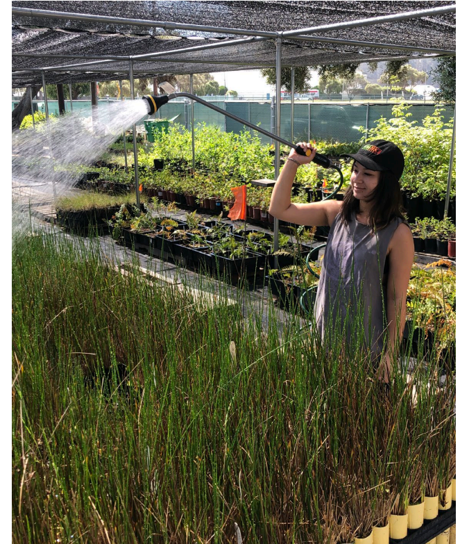
Literacy for Environmental Justice intern watering plants at EcoCenter Nursery (Heron's Head).