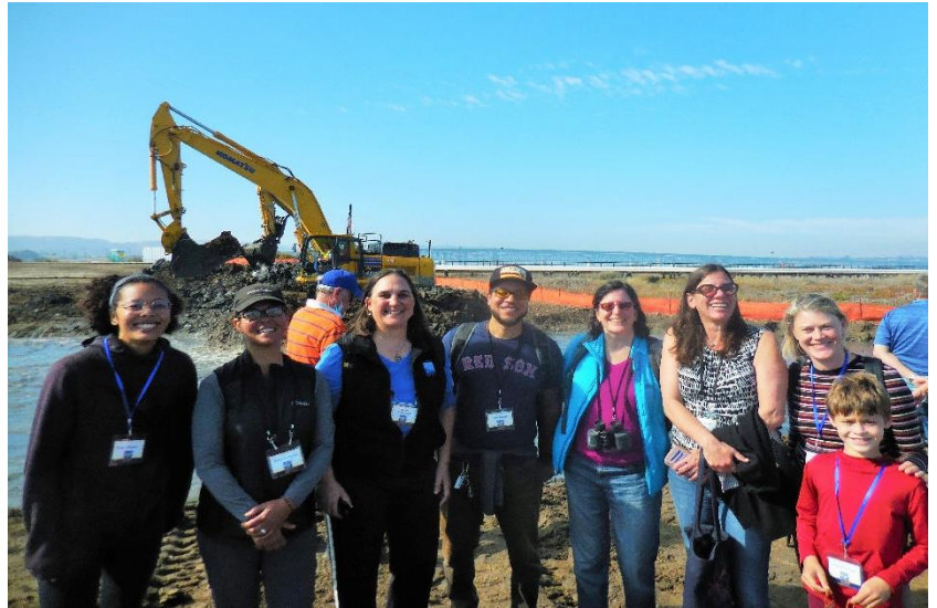
Restoration Authority Staff at the breach of the Lower Walnut Creek Project

In five years, the San Francisco Bay Restoration Authority has awarded over $125 million generated by Measure AA to support a broad range of large baylands restoration projects, small-scale pilot projects, and planning and design projects that are improving the water quality, climate resilience, wildlife habitat, and public access opportunities at the shoreline in each of the Bay Area's nine counties. Measure AA's locally generated funding has been a very effective magnet to bring matching funds to help restore the Bay; Authority projects have leveraged over $175 million in funding from State and Federal and other sources over the past five years.