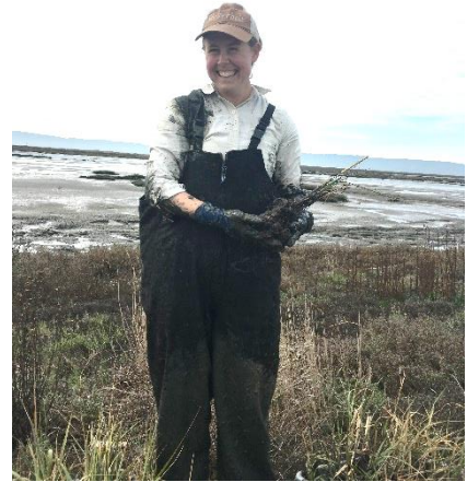
Invasive Spartina Removal at Eden Landing

This $4,000,000 grant to the California Invasive Plant Council supports the continued eradication of invasive Spartina (cordgrass) and enhancement of critically important tidal marsh and mudflat habitat throughout San Francisco Bay. The collaborative Invasive Spartina Project includes invasive Spartina monitoring and treatment, native marsh plant revegetation, California Ridgway's rail monitoring, and community outreach and job training. During FY2021-2022, in addition to continued efforts to monitor and treat invasive Spartina, project partners propagated and outplanted 21,000 plants at several sites around the Bay and the grantee planned and led more than 10 public outreach presentations. Quality control occurred on all 2021 season monitoring data in Spring 2022, along with planning for June 2022-January 2023 season.