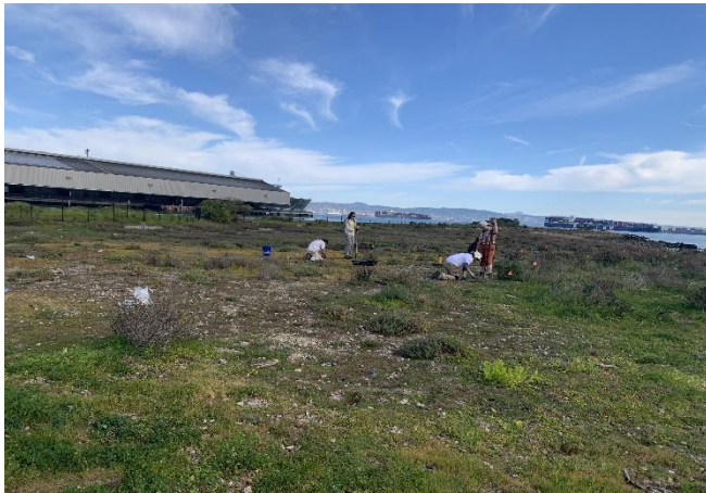
LEJ working at Heron's Head

A grant of $297,000 is funding restoration and enhancement of wetland and upland habitat along the Bay shoreline in Bayview Hunters Point, as part of a larger project to create a living shoreline to protect the tidal marsh from erosion. The habitat enhancement of the shoreline park is ongoing. The grantee, the Port of San Francisco, has contracted with the community based nonprofit restoration organization Literacy for Environmental Justice (LEJ) to complete the Phase 1 restoration work with a team of their "Eco-Apprentices." Eco-Apprentices are low-income transitional age youth (18-25 years old) with a passion for conservation,