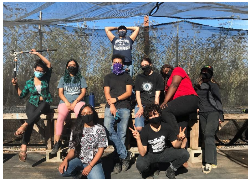
Literacy for Environmental Justice (LEJ) Eco-Apprentices

During consultations with applicants for the competitive Grant Round and Community Grants Program, staff encourage applicants to include adequate funding in their budgets for paid community participation, internships, and workforce development for residents of economically disadvantaged communities, as well as funding for food and childcare at community engagement events. The Authority is also able to work with fiscal sponsors if applicants are community organizations that are not a nonprofit with 501(c)(3) status. Additionally, we have increased the indirect cost reimbursement limit from 15% to 20% of a total grant award, which allows organizations to recover more overhead costs.