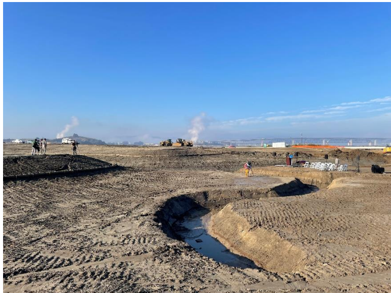
Levee Breach at Lower Walnut Creek

A grant of $7,929,855 to the Contra Costa County Flood Control and Water Conservation District for this project in Martinez funds improvement of habitat quality, diversity, and connectivity along 3.2 miles of creek channel (up to 279 acres). The grantee restored tidal influence to the North Reach of the project by breaching the levee separating the site from the bay in October 2021. The project had a robust construction season with some of the final portions of the restoration phase of construction wrapping up at the end of March 2022. The later part of the construction efforts focused on the installation of some of the 31,100 native plants and the supporting irrigation system.