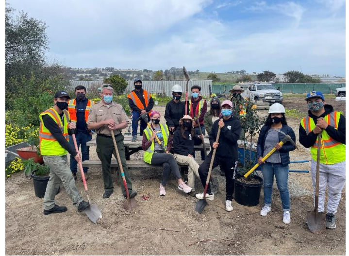
Candlestick Point Stewardship Project.

This grant for $100,000 funds Literacy for Environmental Justice (LEJ) to revegetate and steward upland habitat adjacent to baylands habitats in the Candlestick Point State Recreation Area on the highly urbanized southeastern shoreline of San Francisco. The project includes workforce development training, trash clean-up, monitoring and reporting of destructive activities for a two-year period, native plant propagation, and community engagement.