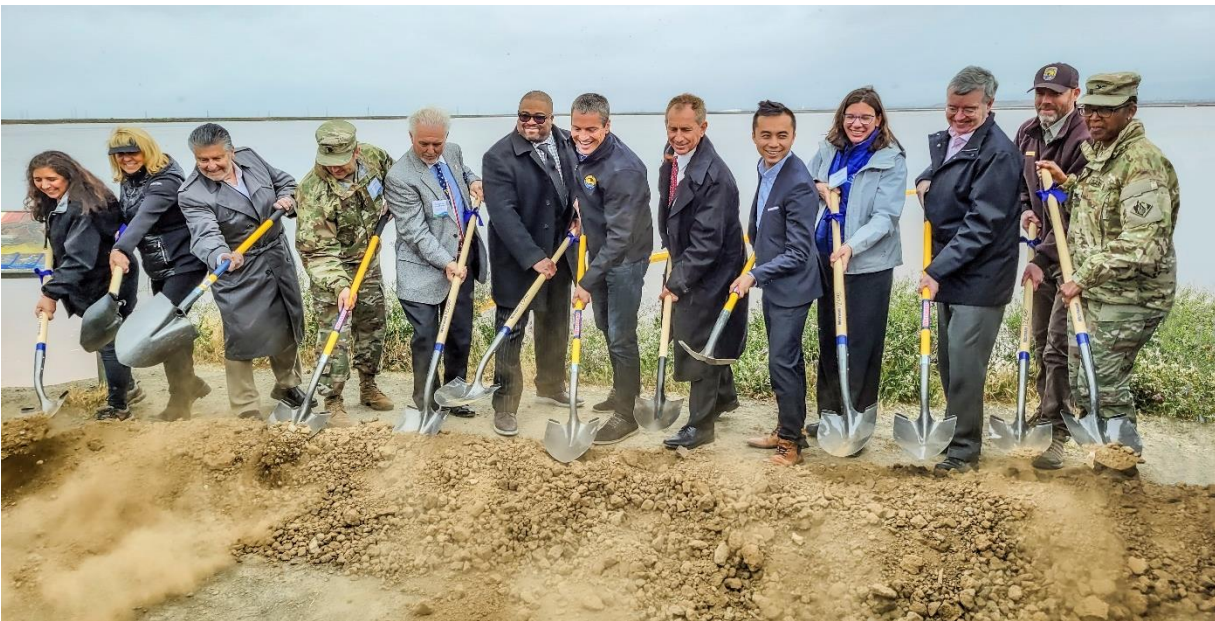
Groundbreaking of the South San Francisco Bay Shoreline Project

Construction of Reaches 1-3 of the flood risk management levee in the City of San Jose began in December 2021 by the US Army Corps of Engineers and is slated for completion in early 2024. Reach 1 extends from Alviso Marina to Union Pacific Railroad and Reaches 2 and 3 stretch from the Union Pacific Railroad to Artesian Slough. Reaches 4-5 of the levee, which extend from the Artesian Slough East to Coyote Creek, are in the design phase. The project will ultimately include a four-mile levee and 3,000 acres of restored wetlands, as well as trails and public access amenities.