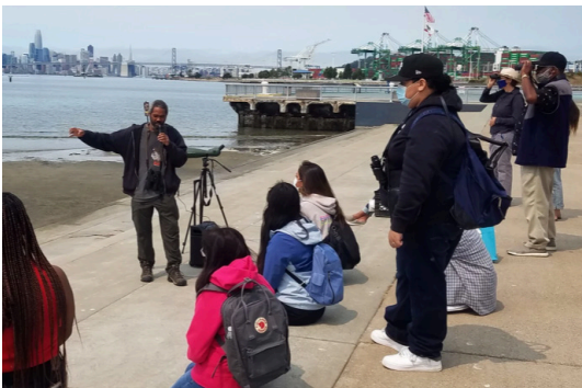
Photos: Above: Groundbreaking at the South San Francisco Bay Shoreline Project Photo: Valley Water Below: Oakland Shoreline Leadership Academy Photo: West Oakland Environmental Indicators Project