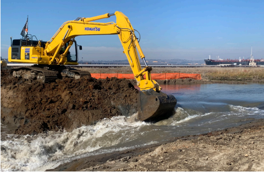
Photo: Breaching the levee at the Lower Walnut Creek Restoration Project