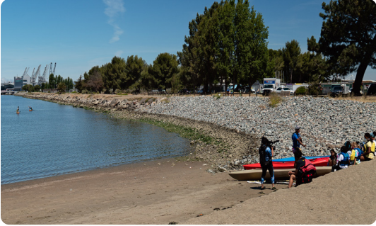
Photos: Encinal Dune Restoration Project in Alameda