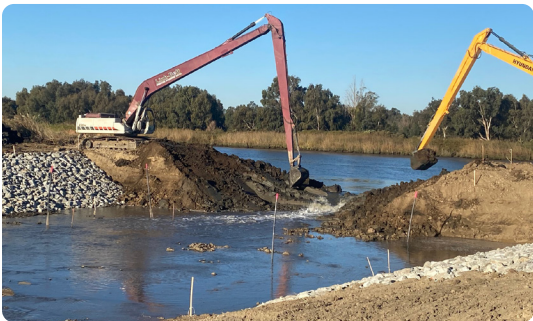
Photos: Above: Groundbreaking at the 900 Innes Remediation Project in San Francisco. Below: Beginning of Phase 1 breach at Montezuma Wetlands in Solano County.