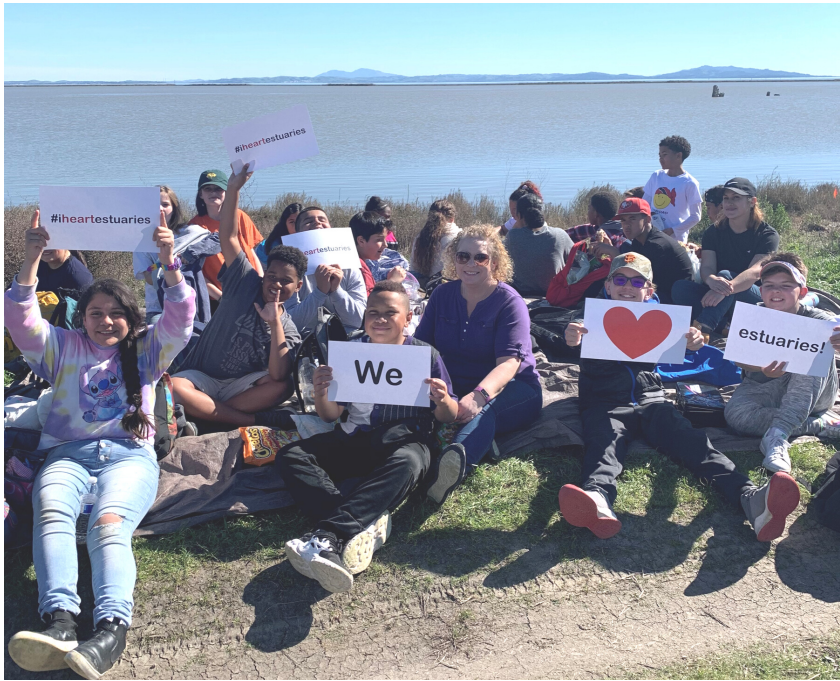
Students and Teachers Restoring a Watershed (STRAW)