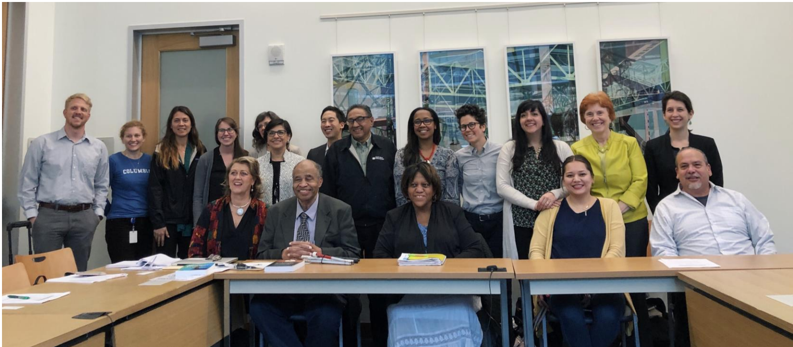
BCDC's EJ Commissioner Working Group members, EJ Review Team members, and BCDC staff.